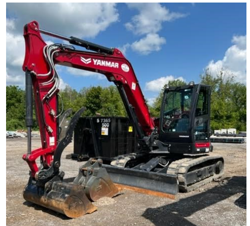
2023 Yanmar SV100