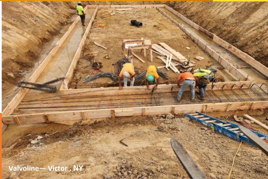
Valvoline— Victor , NY