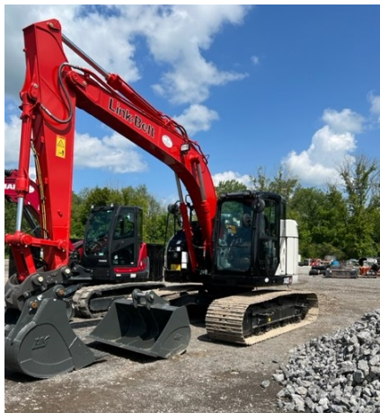
2023 Link Belt 145x4