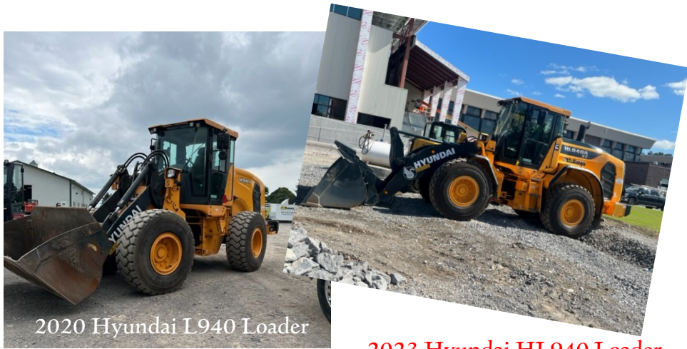
2020 Hyundai L940 Loader

Both excavators are new manufactures for our fleet by design. So far, we have received much positive feedback from the crew that they are great additions to the fleet!